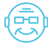
SILENT GEN (ages 73+)