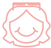
MILLENNIALS (ages 23–38)