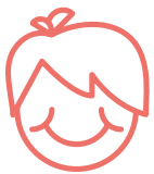
GEN Z (ages 18–22)

Diving into this data even further, we discovered that the younger the consumer, the less likely they are to have established a PCP. Baby Boomers and the Silent Generation value longtime PCP loyalty, and for good reason: they have more complicated medical histories and typically need more extensive care. They value familiarity; Gen Z and Millennials on the other hand, look to convenience, speed, and ease of access. These younger demographics are increasingly dissatisfied with PCP care, and have no issue with looking for alternatives to meet their needs. Enter urgent care facilities.