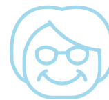
BABY BOOMERS (ages 55–73)