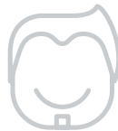
GEN X (ages 39–54)